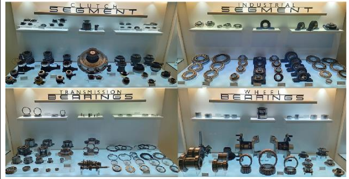
Figure 6: Texspin Bearings, which specializes in the clutch segment, recently diversified its product base and has launched industrial products for the aftermarket segment

SOURCE: INCRED RESEARCH, COMPANY REPORTS