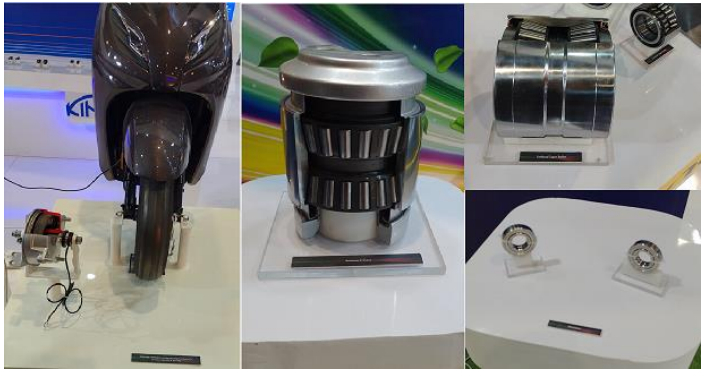
Figure 5: NBC Bearings (anticlockwise): Sensor-integrated bearings for 2W wheel hub, class C bearings for the railways, aerospace bearings, and unitized taper roller bearings