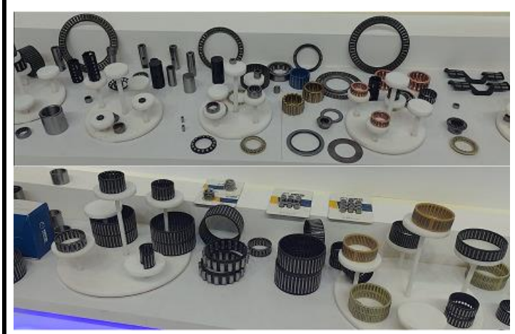
Figure 4: NRB Bearings: Various needle roller bearings