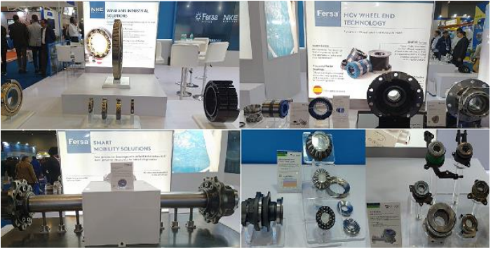
Figure 7: Fersa/Delux Bearings (anticlockwise): Wind and industrial bearings, smart mobility wheel bearings, power-dense bearings for CVT transmission, powertrac actuators for tractors, and HCV wheel-end technology