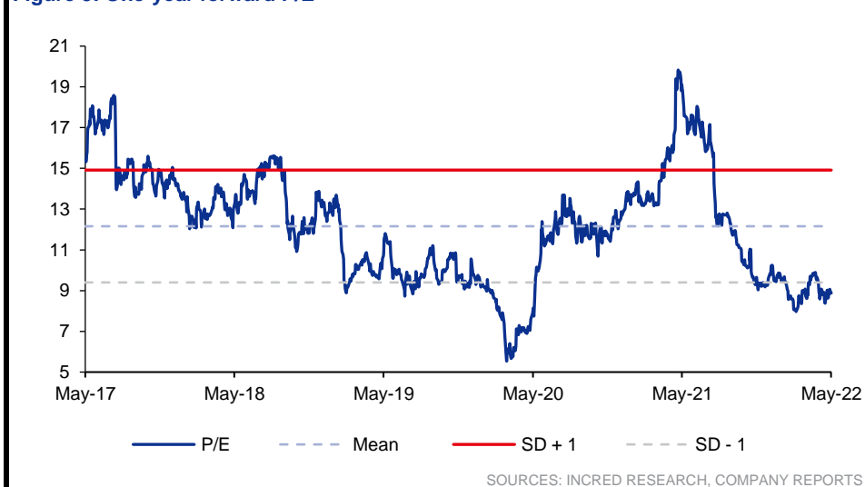
Figure 3: One-year forward P/E